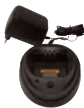
Rapid Desktop Charger - WPLN4139 (Euro) WPLN4140 (UK)