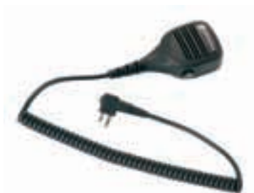
Rugged Remote Speaker Microphone with Audio Jack Socket - MDPMMN4013