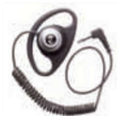
D-Shell Ear Piece for RSM - MDPMLN4620